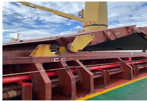
Hatches in tent position and not secured