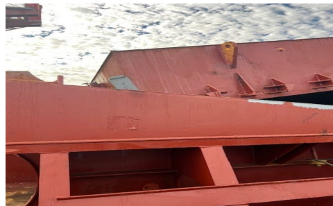
Securing pin not in place