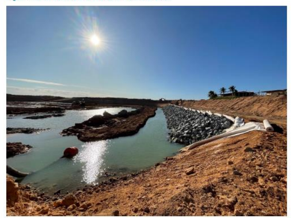
Figure 1- Rock installed across southern batter of basin.