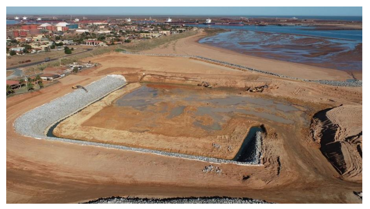
Figure 3: Construction progress of the rock revetment in the marina basin at the end of the Reporting Period, image facing west (July 2022).