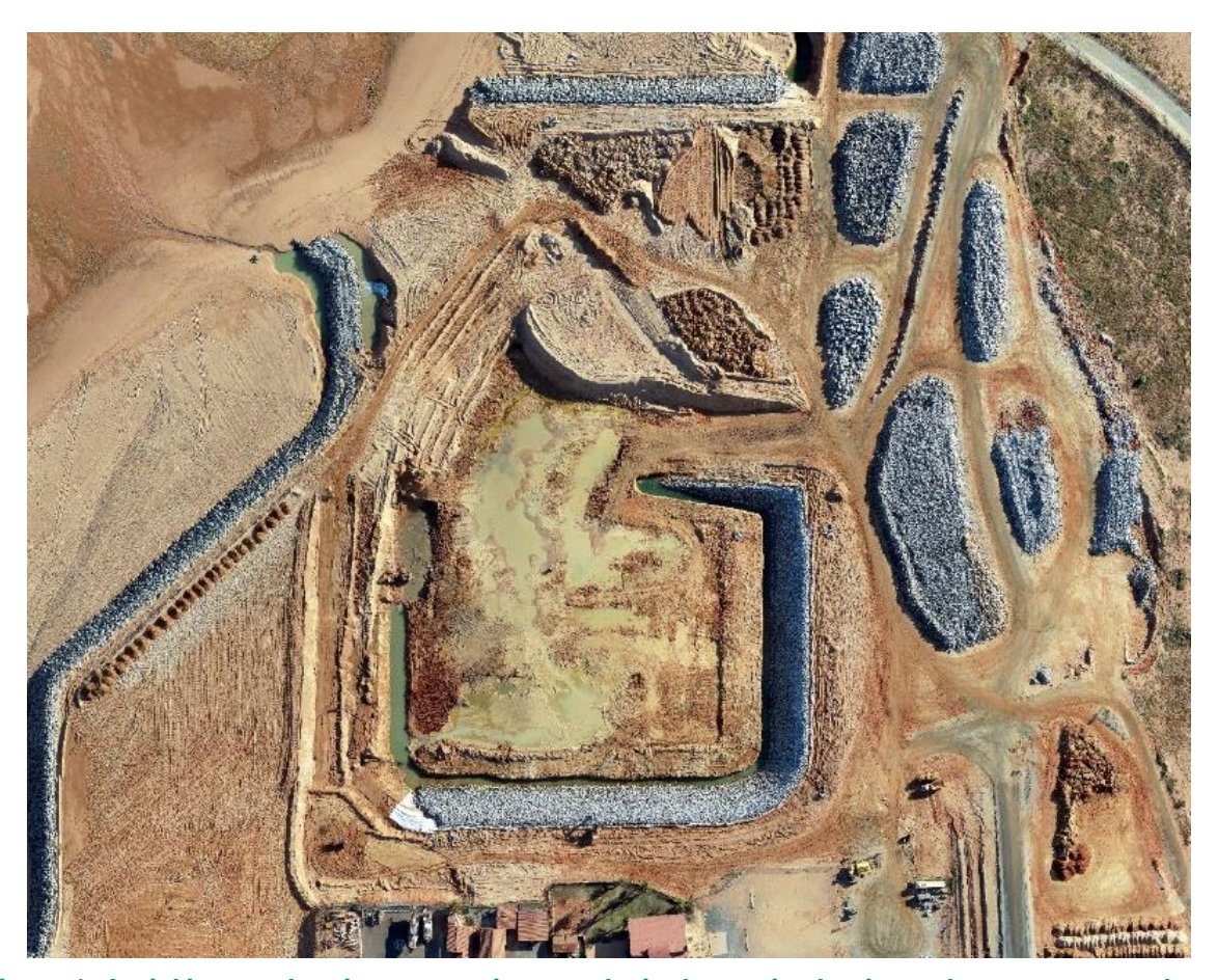
Figure 1: Aerial image showing excavations works in the marina basin, rock revetments and rock storage onsite at the end of the Reporting Period (July 2022).