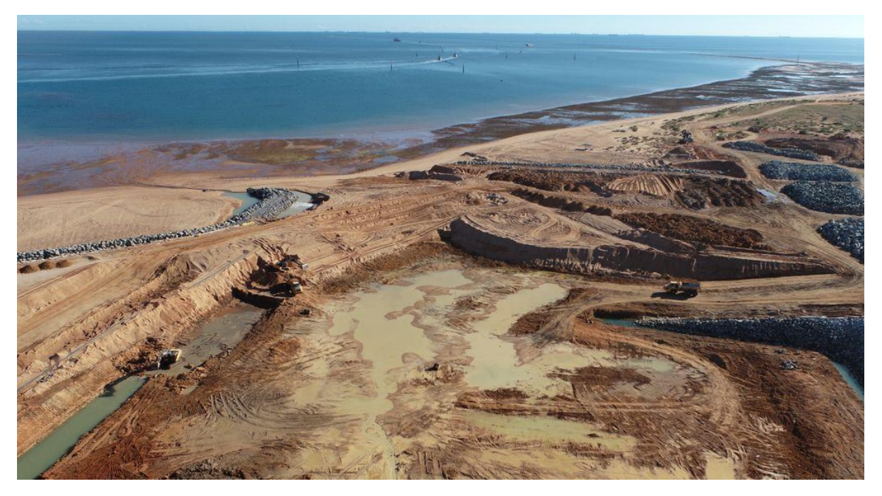
Figure 2: Construction works in the marina basin and inner rock revetments at the end of the Reporting Period, image facing north (July 2022).