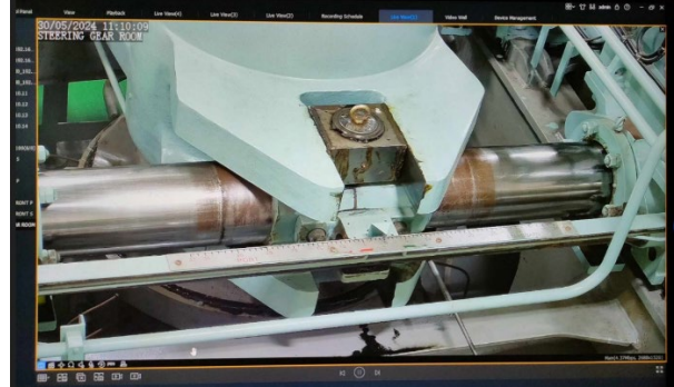
Sample of real-time feed to a CCTV Monitor in the wheelhouse.